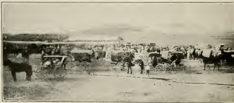
HARVEST CELEBRATION AT CLARION, AUG. 19

A cry is being raised that the world needs a producing class. Or, in other words, there are not sufficient farmers to supply the wants of an ever-increasing population in the world. Hence, whatever tends to increase the number of farmers, will be hailed as a boon to society.